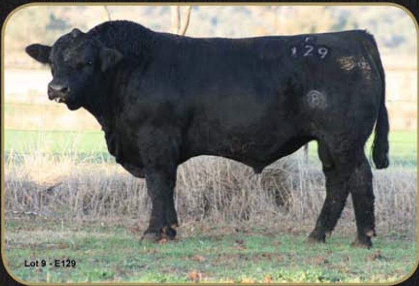
Lot 9 - E129