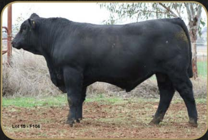
Lot 15 - F104